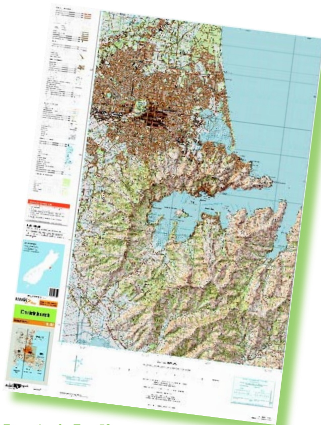
Example of a Topo50 map

To coincide with this shift, LINZ will encourage map users to purchase printed maps that use the NZTM2000 projection.