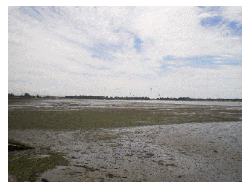
Figure 1. View of the Avon-Heathcote Estuary, Christchurch

This shows the excessive macroalgal growth of Ulva (sea lettuce), characteristic of eutrophic conditions in mudflat estuaries in New Zealand and overseas.