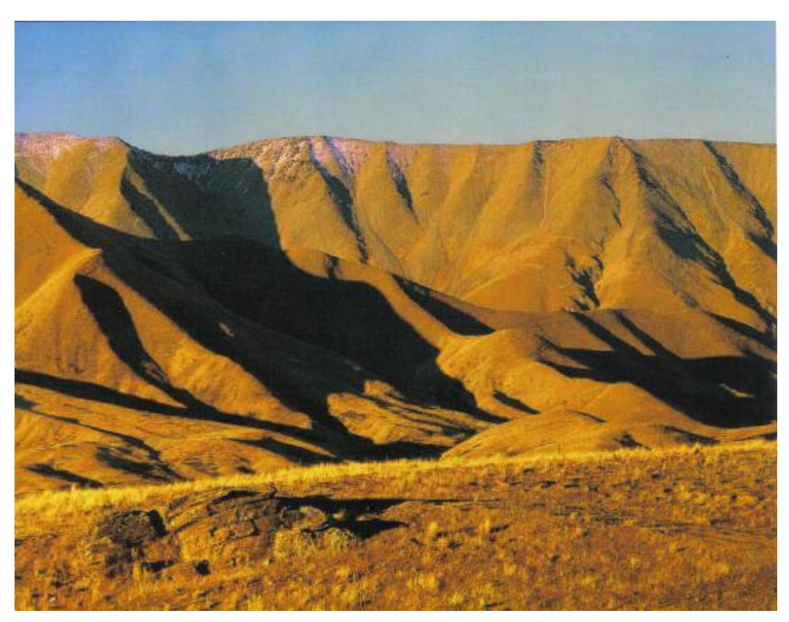
Central Otago Scene – Otago Regional Council promotion

cover photo used for the Proceedings Document was a central Otago landscape scene of the type celebrated at regional, national, even international level - see over: