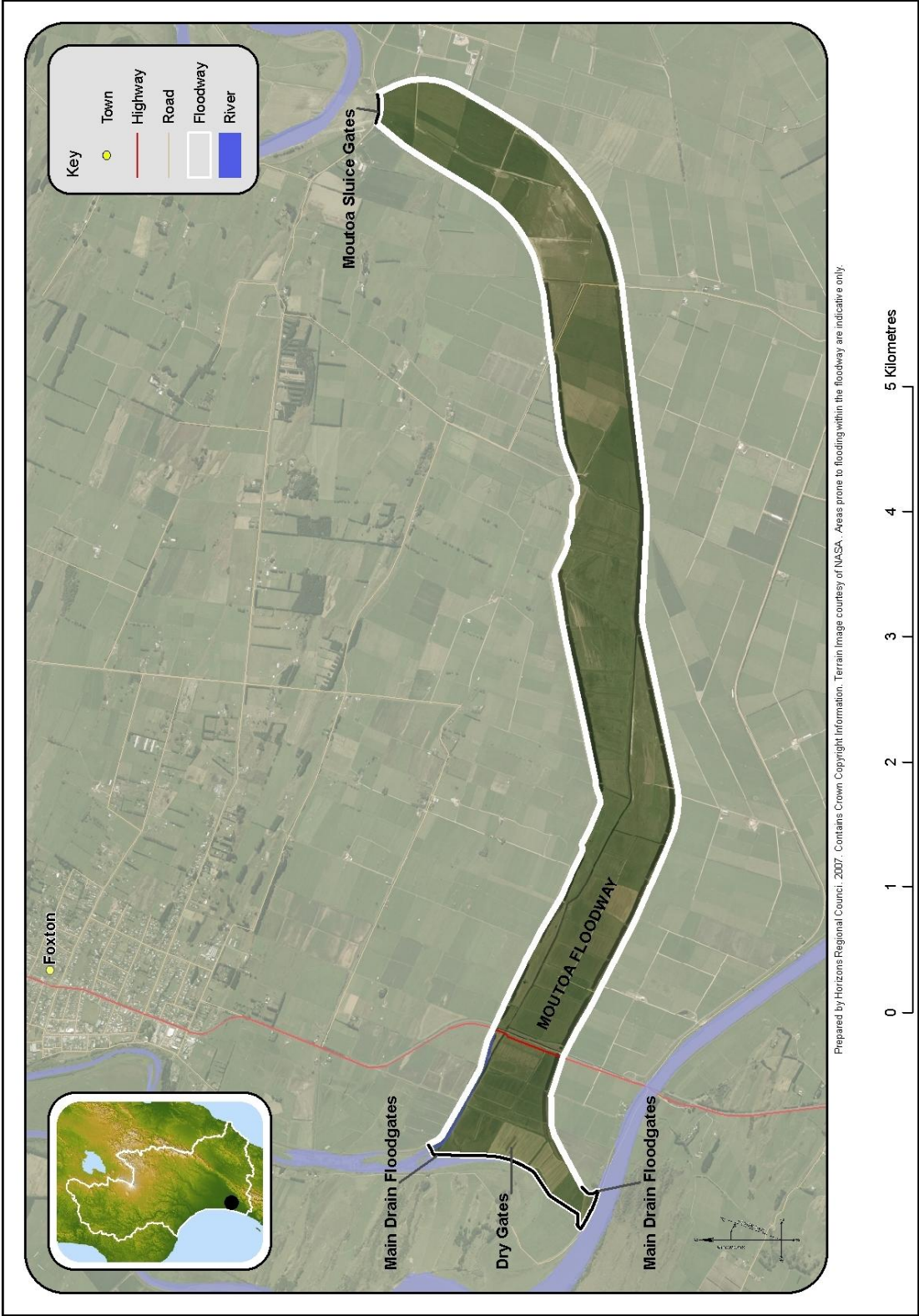
Figure I:2A Moutoa floodway