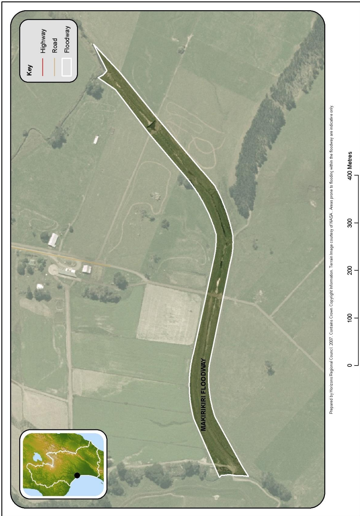
Figure I:5A Makirikiri floodway