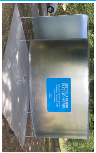
CHANGING ROOM DESIGN SIZE: 3000mm x 1500mm