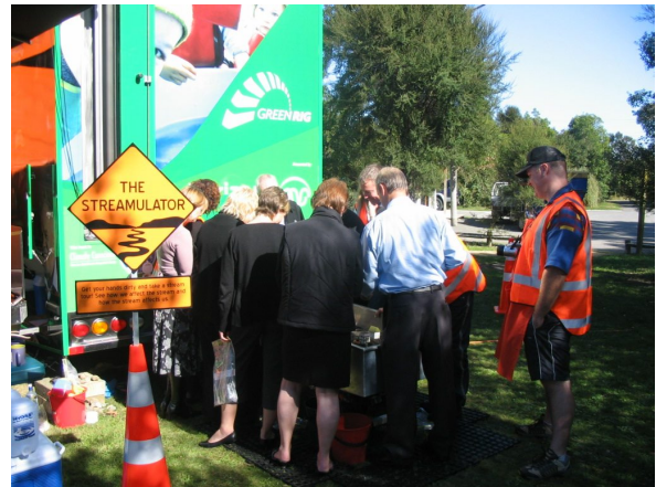
The Streamulator in action

Try your hand at our fun and informative computer games - Place Invaders , How Many Planets do you Need? , NZ Bush Idol and H2You . Get your hands dirty on the Streamulator stream and erosion table or try your hand at the Tower of Power or our special mini-putt Fishin' Mission . Watch the Enviroscape demo or see a groundwater aquifer in action. Learning is fun on the Green RIG!