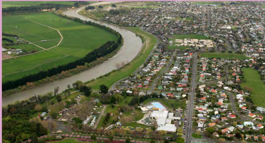
Te awa o Manawatū, Te Papaioea