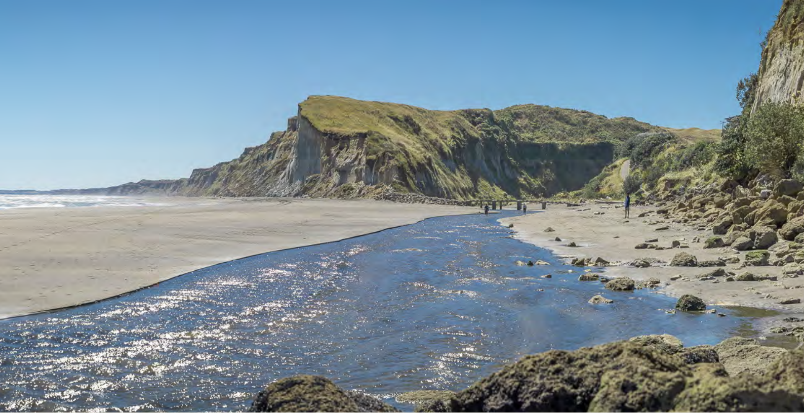
Te Kaunihera-a-rohe o Whanganui

Kei ia takiwā o te takutai moana ōna ake āhuatanga, me te aha, he tukanga whakahaere tō tēnā me tō tēnā.