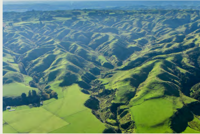
Rangitikei – Te Pū Ao

1 E hurihuri ana te āhuarangi i tēnei wā tonu. Taka ana te wā ka nui, ka rerekē hoki te pānga atu ki ō tātou whānau, ō tātou pāmu, ā tātou pakihī me ō tātau hapori hoki.