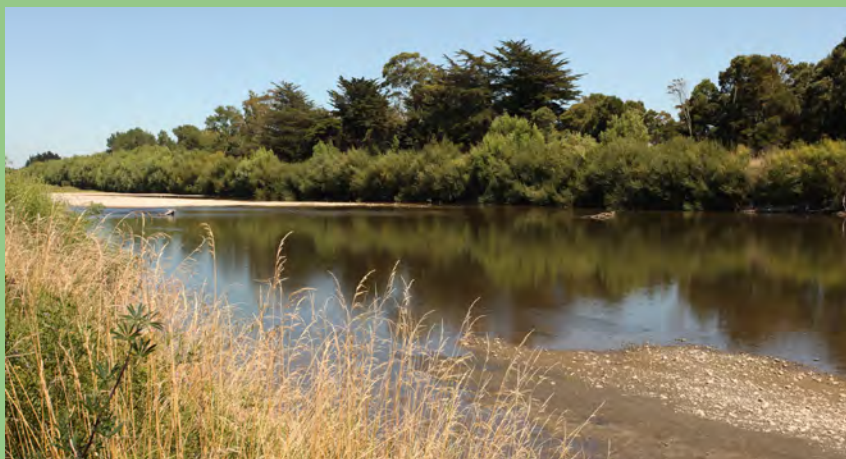
Te awa o Manawatū