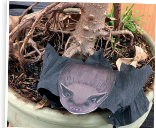
Foraging on the forest floor Getting ready to fly!