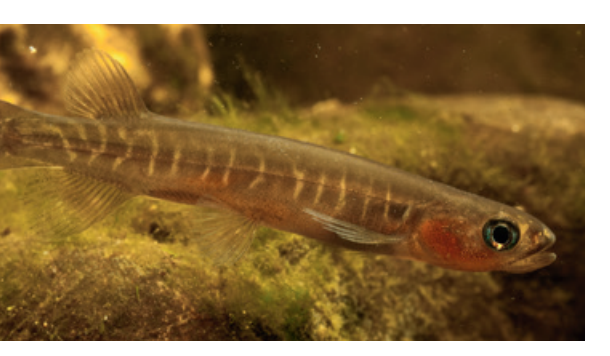
Young banded kōkopu.

A national conversation is starting about the multiple benefits of adopting the Room for the River approach, and at least one council is already trialling the idea, albeit on a small scale (see right). The government has recognised the value of nature-based solutions like this one in its response to climate change.