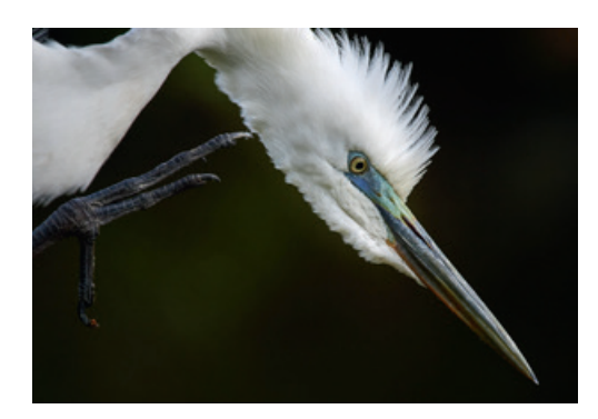
Kōtuku, Waitangiroto River, Westland

Room for the River has a proven track record overseas. It's time to give rivers more room to roam in Aotearoa.