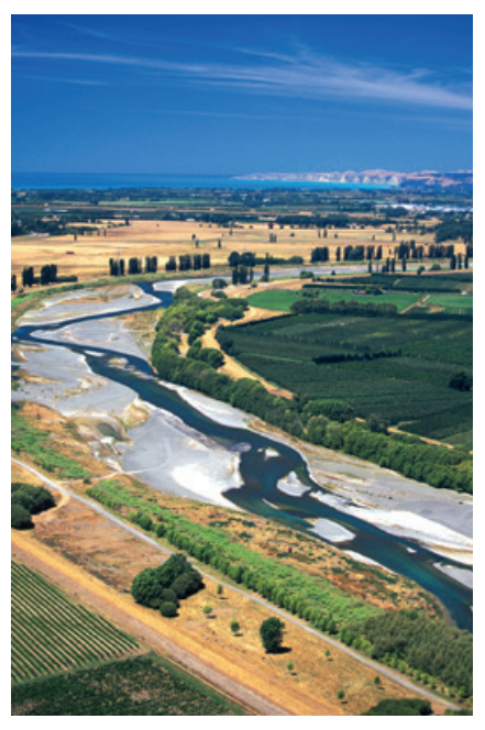
Ngaruroro River, Hawke's Bay

"Making room for rivers is an opportunity to restore those connections. If our awa have room to be themselves, their health will improve. We can help the awa support us again."