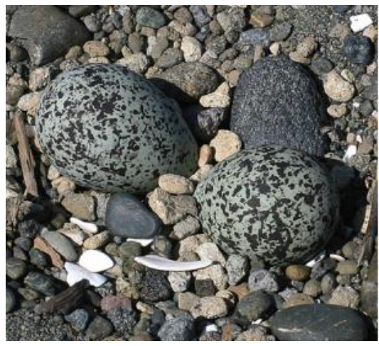
Dotterel nest

Wrybill were chosen because they are considered a threatened species for conservation. Royal spoonbill were chosen because their habitat requirements overlap with most migratory and vagrant waders, and they are not particularly common.