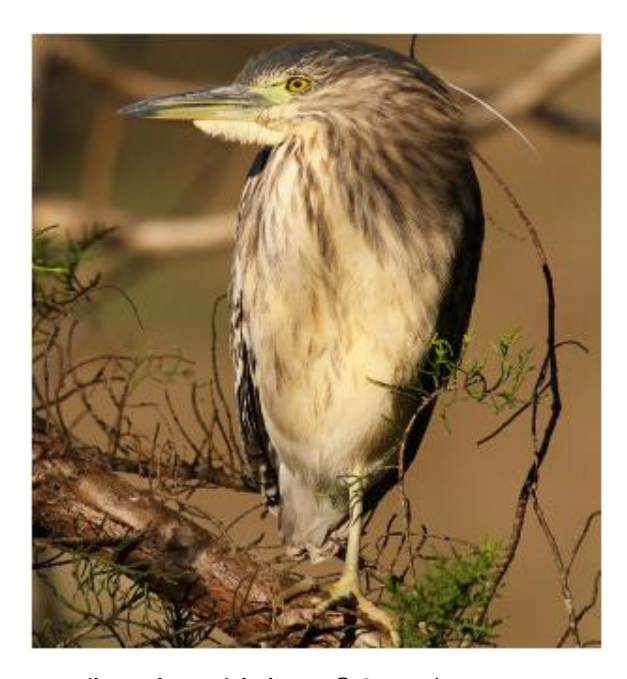
Juvenile Nankeen night heron