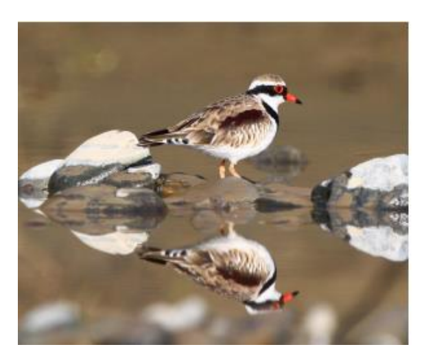
Black-fronted dotterel © Phil Battley