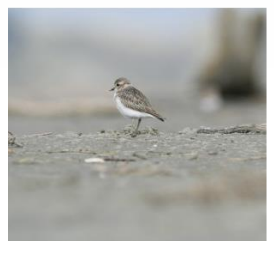
Juvenile banded dotterel

The mud and silt habitats of tidal estuaries are critical feeding grounds for a great number of migratory and residential wading birds. The SOS-R reaches for mud and silt habitats are identified using the known extent of royal spoonbill (kōtuku-ngutupapa) and wrybill (ngutuparore).