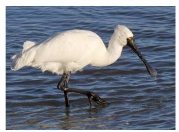
Royal Spoonbill