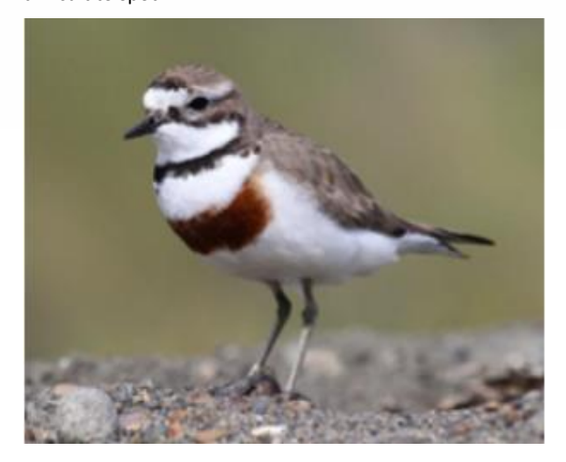
Banded dotterel