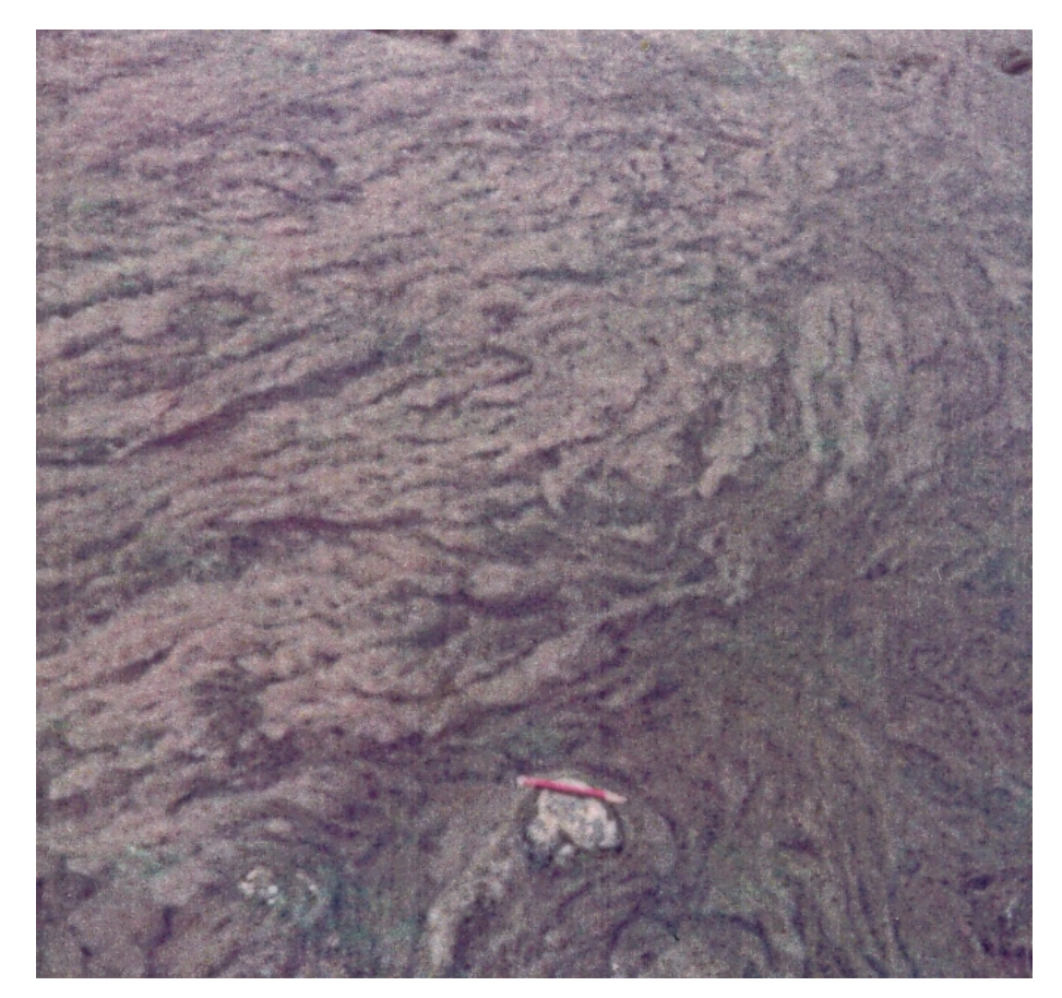
Figure 2. Sewage fungus in the Manawatu River below Palmerston North, January 1984. Note pencil in lower photograph for scale.

10. Figure 2 shows sewage fungus in the Manawatu River, at the end of Akers Rd downstream of the Palmerston North City and Longburn Dairy Factory discharges on 14 January 1984, prior to the reduction of BOD load in the "Manawatu River clean-up" of the 1980s. This demonstrates that sewage fungus degrades stream aesthetics significantly.