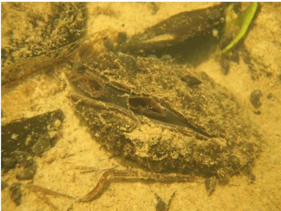
Fig. 1. Kakahi located in the streambed, showing open siphons.