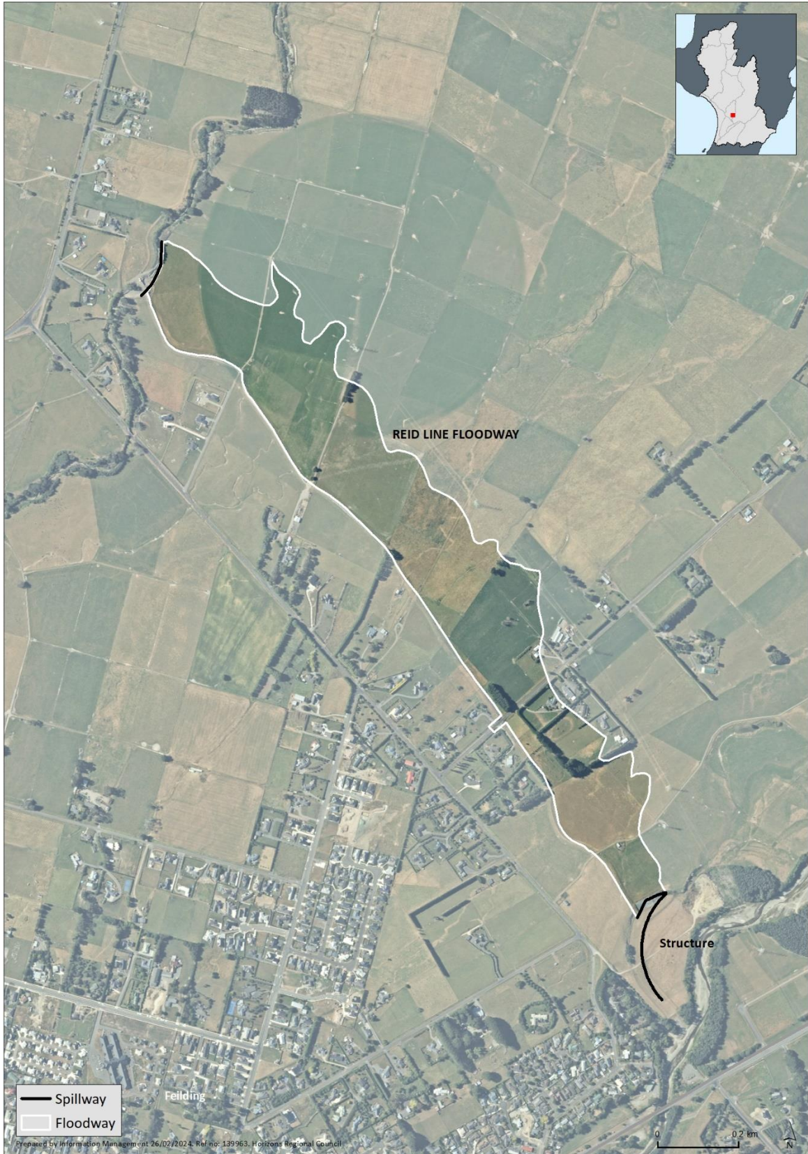
Figure 43 - Reid Line floodway