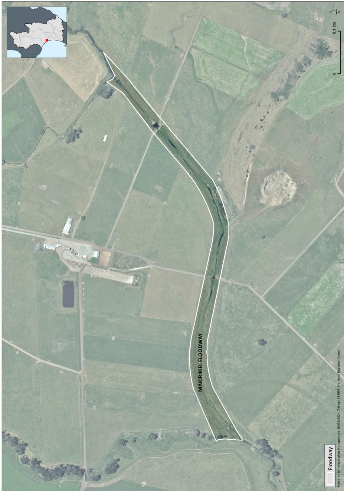
Figure 44 - Makirikiri floodway