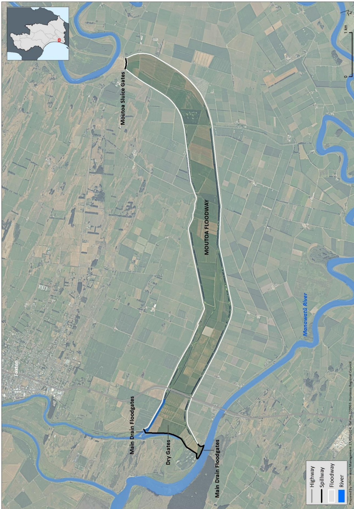
Figure 41 - Moutoa floodway