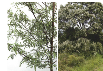
Kānuka Kunzea ericoides