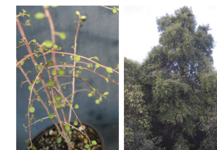
Narrow-leaved Lacebark Hoheria angustifolia