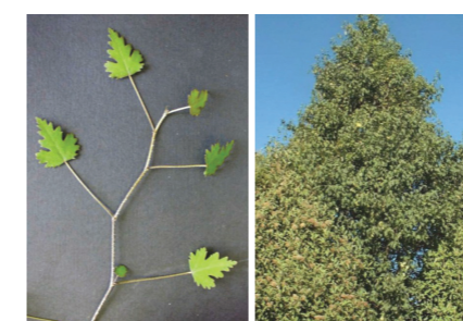
Ribbonwood Plagianthus regius