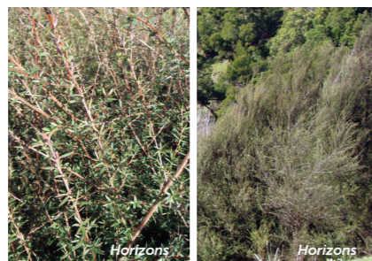
Mānuka Leptospermum scoparium