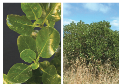
Taupata Coprosma repens