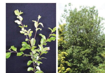
Kohuhu Pittosporum tenuifolium