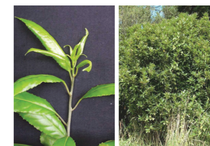
Mahoe Melicytus ramiflorus