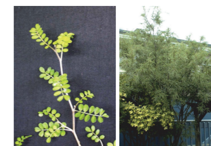
Kōwhai Sophora microphylla