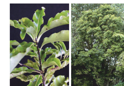
Lemonwood Pittosporum eugenioides