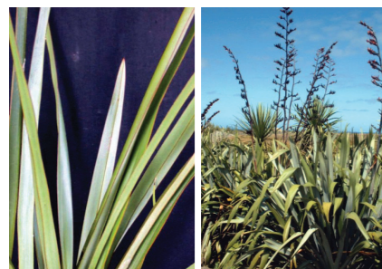
Flax, Harakeke Phormium tenax