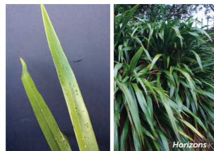
Mtn flax, Wharariki Phormium cookianum