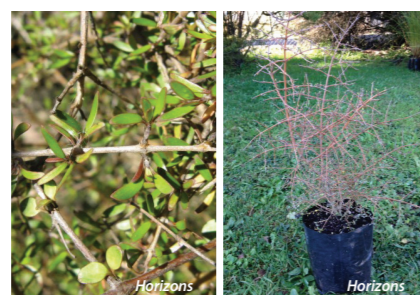
Mingimingi Coprosma propinqua