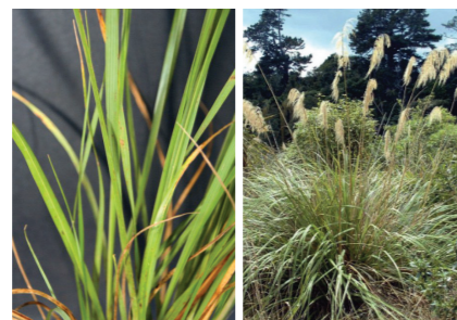
Toetoe Cortaderia fulvida