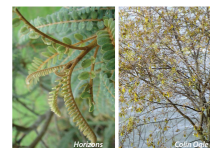
Kōwhai Sophora godleyi (North of Palmerston North)