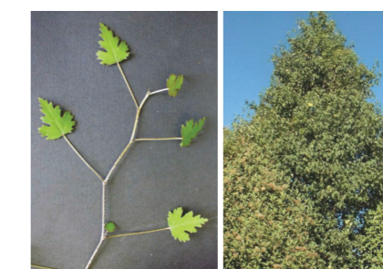
Ribbonwood Plagianthus regius