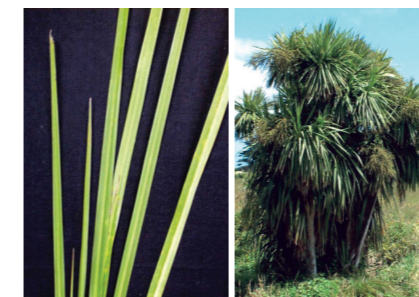
Cabbage Tree Cordyline australis