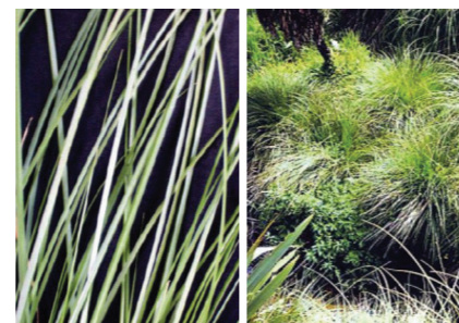
Purei Carex secta