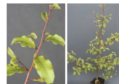
Red Matipo Myrsine australis