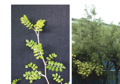
Kōwhai Sophora microphylla