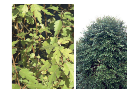
Long-leaved Lacebark Hoheria sexstylosa