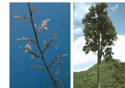
Kahikatea Dacrydium dacrydioides