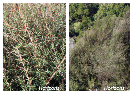
Mānuka Leptospermum scoparium