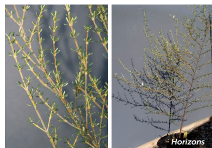
Coastal shrub daisy Olearia solandri