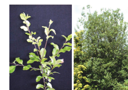
Kohuhu Pittosporum tenuifolium