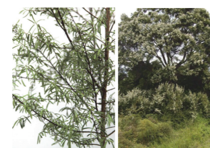
Kānuka Kunzea ericoides