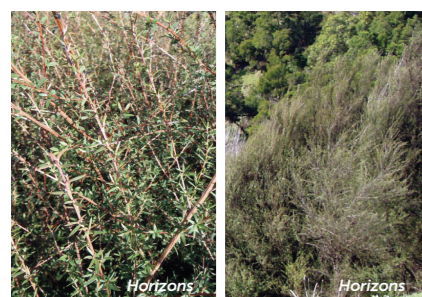
Mānuka Leptospermum scoparium