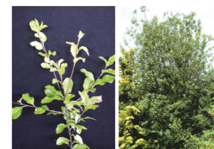
Kohuhu Pittosporum tenuifolium