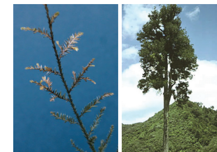
Kahikatea Dacrycarpus dacrydioides