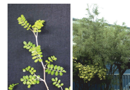
Kōwhai Sophora microphylla