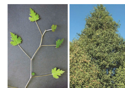
Ribbonwood Plagianthus regius