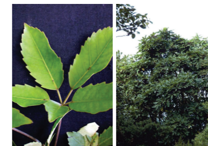
Five-finger Peudopanax arboreus