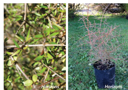
Mingimingi Coprosma propinqua