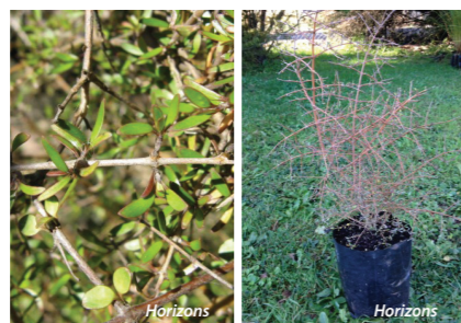
Mingimingi Coprosma propinqua