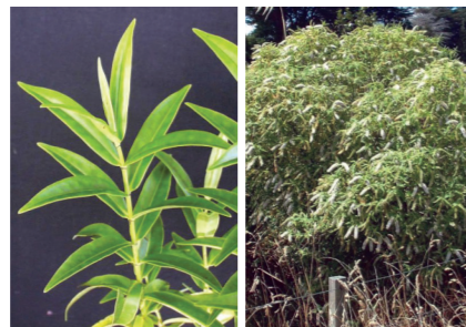
Koromiko Hebe stricta