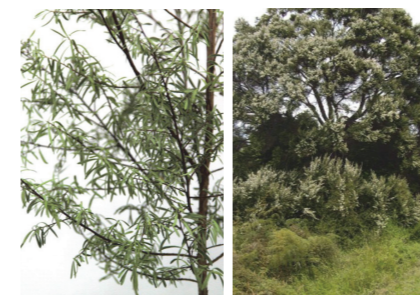
Kānuka Kunzea ericoides