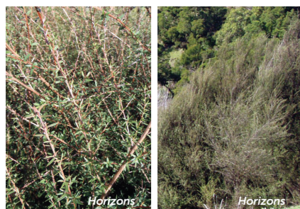
Mānuka Leptospermum scoparium