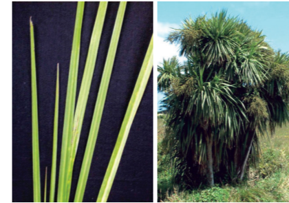
Cabbage Tree Cordyline australis