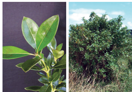
Karamu Coprosma robusta