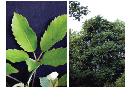
Five-finger Peudopanax arboreus