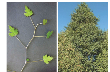
Ribbonwood Plagianthus regius