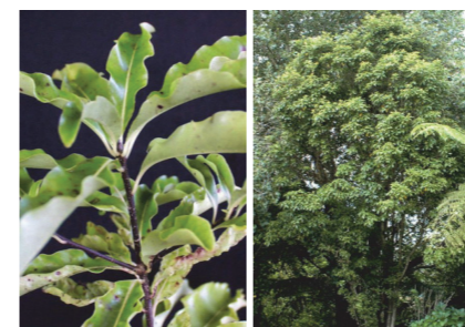
Lemonwood Pittosporum eugenioides