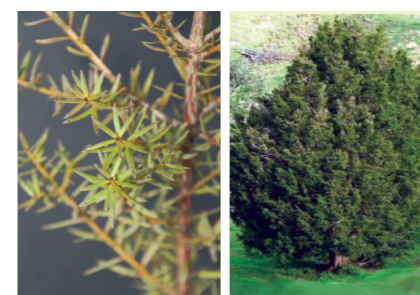
Tōtara Podocarpus totara