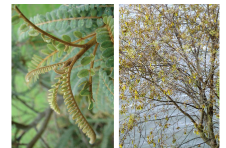
Kowhai Sophora godleyi