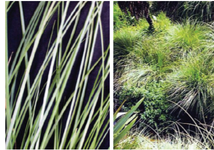
Purei Carex secta