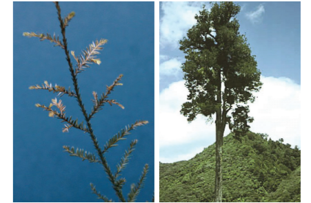
Kahikatea Dacrycarpus dacrydioides