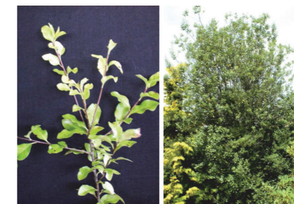
Kohuhu Pittosporum tenuifolium