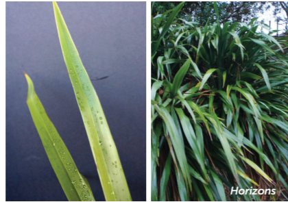
Mtn flax, Wharariki Phormium cookianum