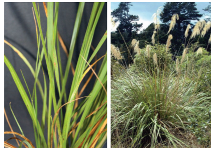
Toetoe Cortaderia fulvida