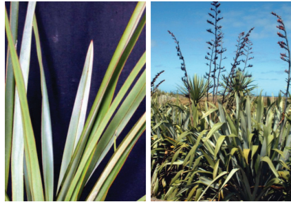
Flax, Harakeke Phormium tenax