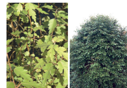
Long-leaved Lacebark Hoheria sexstylosa