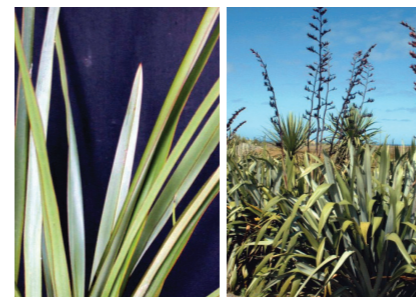
Flax, Harakeke Phormium tenax