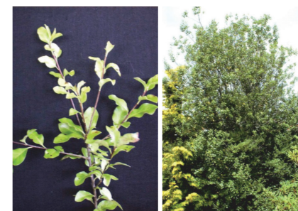
Kohuhu Pittosporum tenuifolium