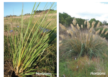
Swamp Toetoe Cortaderia toetoe