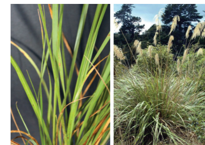
Toetoe Cortaderia fulvida