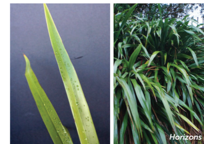
Mtn flax, Wharariki Phormium cookianum