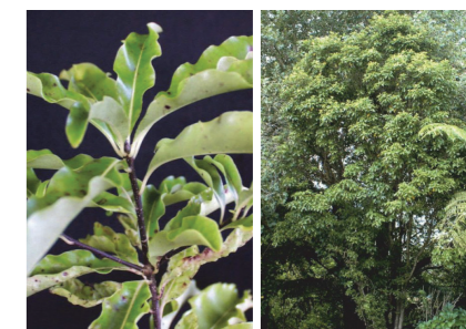
Lemonwood Pittosporum eugenioides