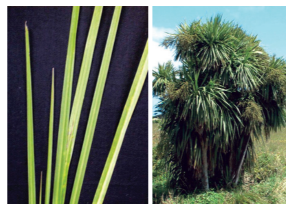
Cabbage Tree Cordyline australis